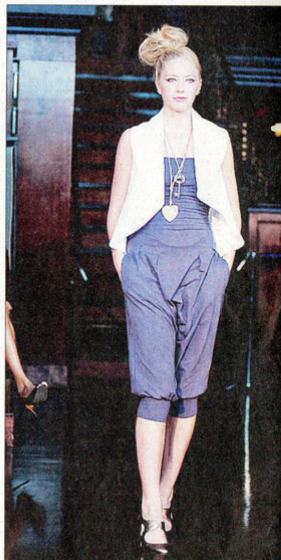
This jumper suit combines an upscale look with wearability. Chu was inspired to start designing when she saw how many people in other parts of the world do with few resources.